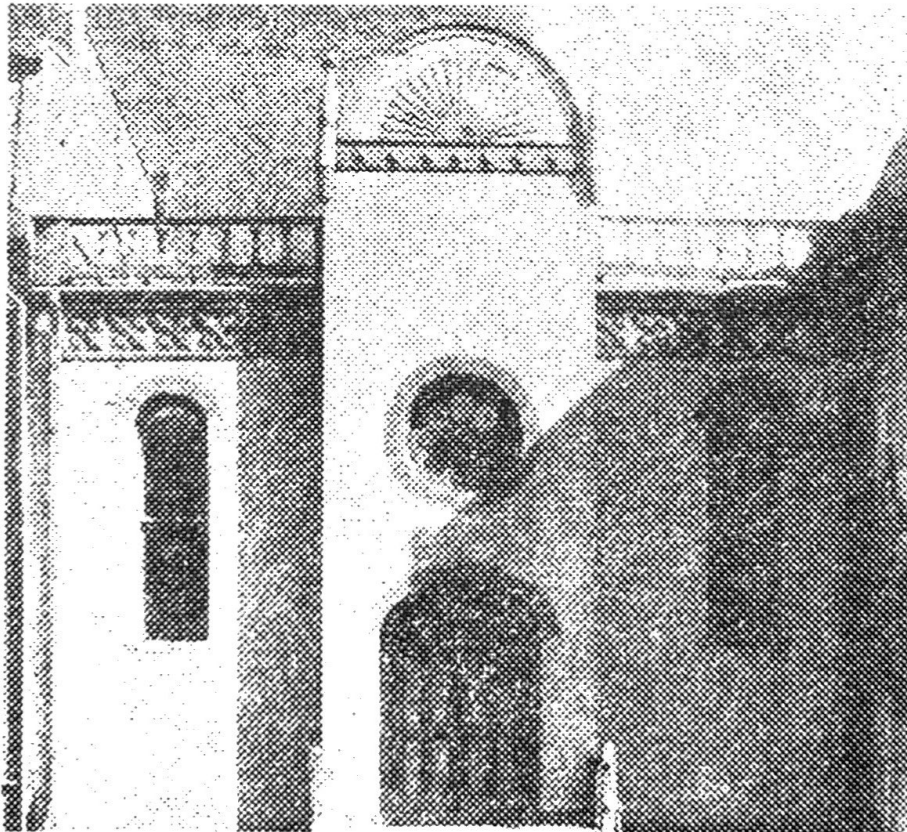
Temple Street Congregational Church, c. 1860.

The aid which whites gave in establishing the Temple Street Church has been noted, yet had it not been for the perseverance and religious convictions of a small group of blacks, the project would never have achieved the success which it did. It is probable that a church for Afro-Americans would have been established eventually, but this would have had to wait until the majority of the whites found it to their interest to have separate congregations. The twenty-five who were the original members of Temple Street caused a radical change in the land of steady habits, and made a significant contribution to the history of the New Haven black community. The original membership consisted of four men and twenty-one women: Mr. Nicholas Cisco, Mr. Bias Stanley, Mr. John Williams, Mr. Robert M. Park, Mrs. Dorcas Lanson, Mrs. Adeline Cooper, Mrs. Margaret Johnson, Miss Clarinda Brown, Miss Lucy Griffin, Miss Louisa Phillips, Mrs. Theodocia Diggins, Miss Dianthy Whitmore, Miss Ellen Thompson, Miss Luzetta Lewis, Miss Catharine Freeman, Mrs. Catharine Wilson, Mrs. Sylva Dowry, Miss Charlotte Asher, Miss Flora Chatfield and Miss Eliza Freeman. 12