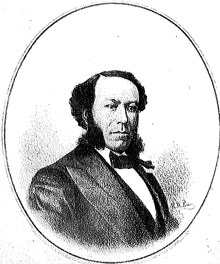
HON. JOSEPH H. RAINEY M.C.